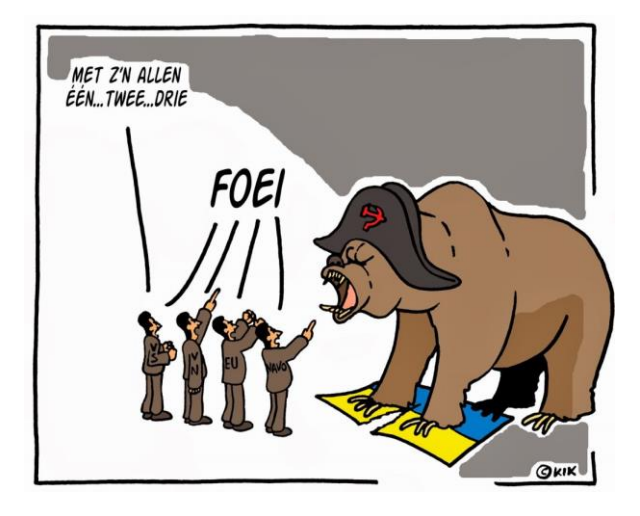
Text on the caricature: "all toghether: BAD"